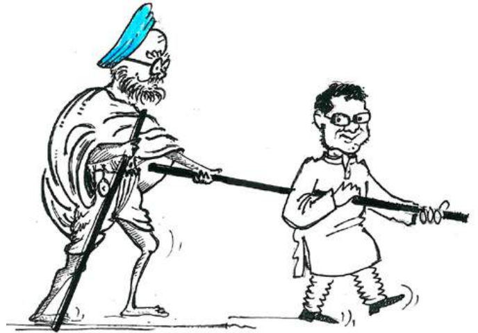
Rahul Gandhi speculated to take bigger roles as Party President : News

A smile 😊 is the shortest distance between two people